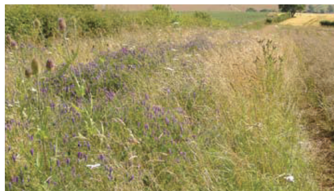
Adding wildflowers to grass margin seed mixtures is good for bees and butterflies.

The understanding to be gained from the SAFFIE field studies on crops and margins will lead to sound advice on the best options for biodiversity in the arable environment. This will be combined with an understanding of the costs for farmers, so they can incorporate cost-effective management options into their farming businesses.